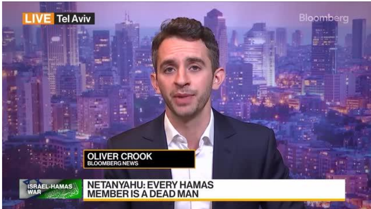
Hamis Leaders Targeted as Ground War Looms