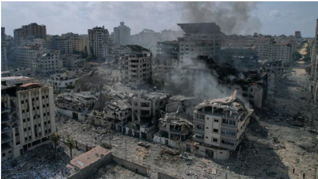
Israel-Hamas War Enters 5th Day