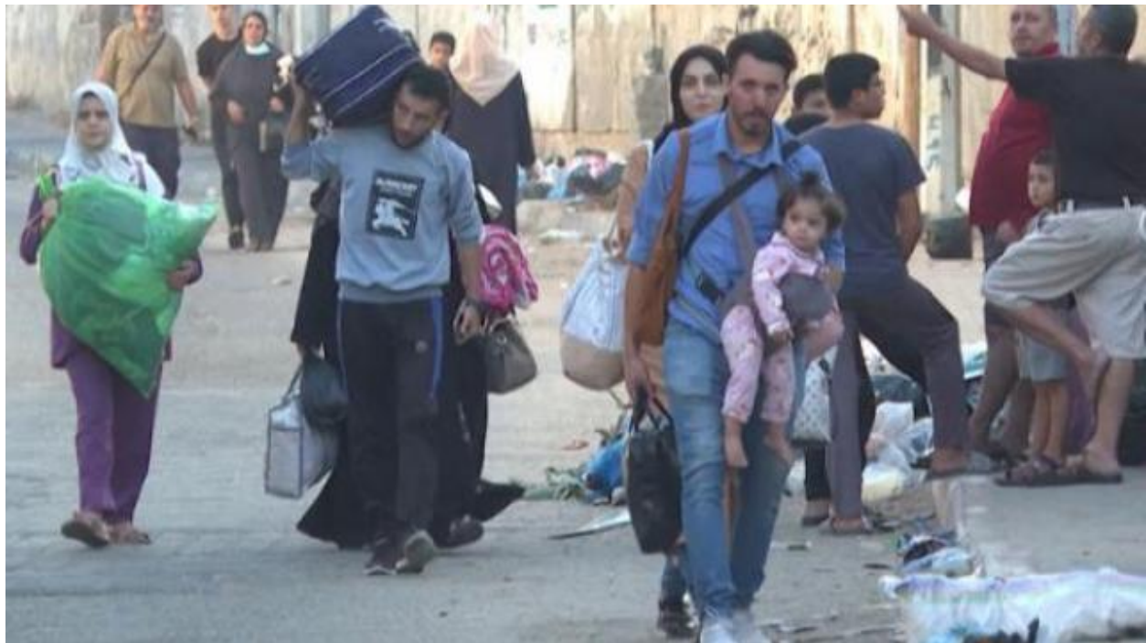
'Nowhere for them to go': See report from inside Gaza as Palestinians are told to evacuate General news |