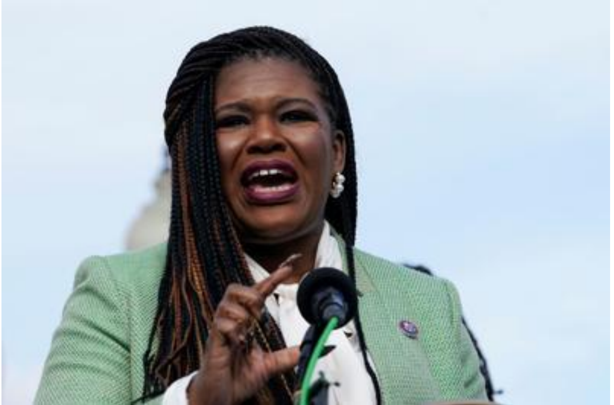
Rep. Cori Bush, D-St. Louis, speaks during a news conference on Thursday, Dec. 8, 2022, on Capitol Hill in Washington.

ST. LOUIS — U.S. Rep. Cori Bush joined other elected officials this weekend by reacting to Hamas’ surprise attack on Israel. But unlike statements issued by others, Bush’s drew sharp condemnation, including from fellow lawmakers.