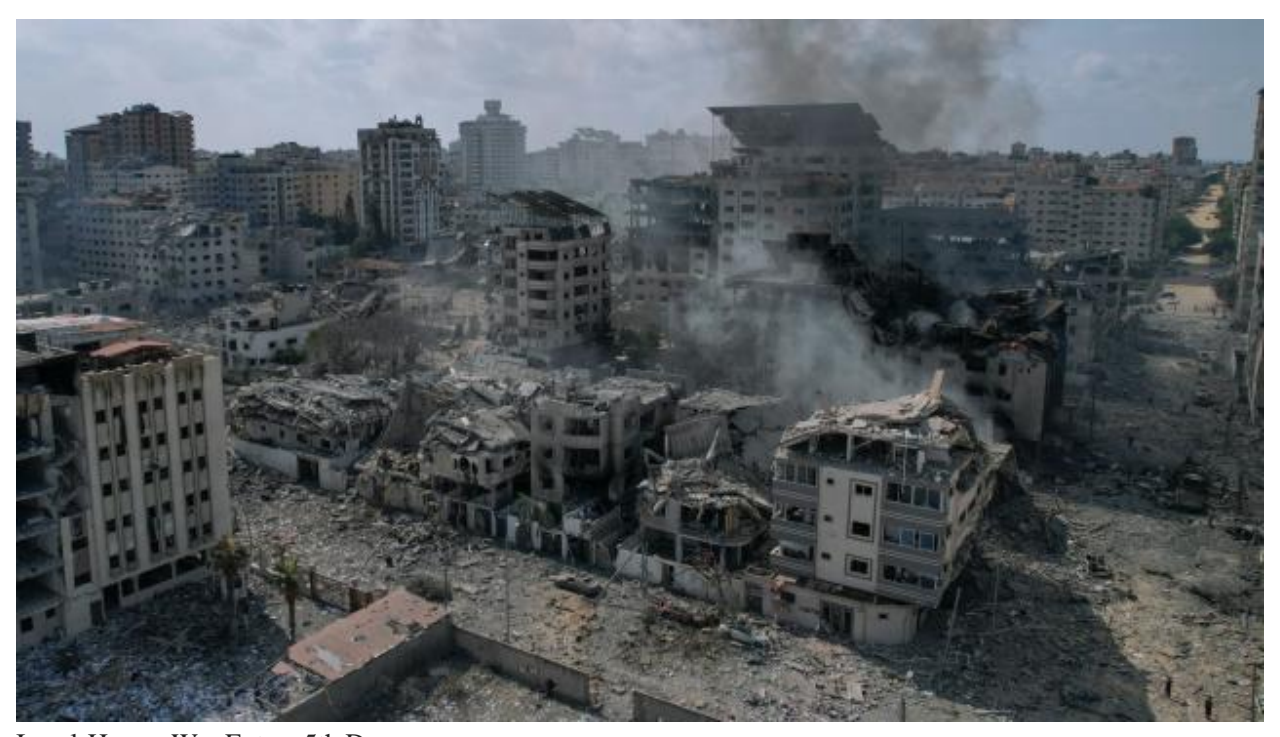
Israel-Hamas War Enters 5th Day