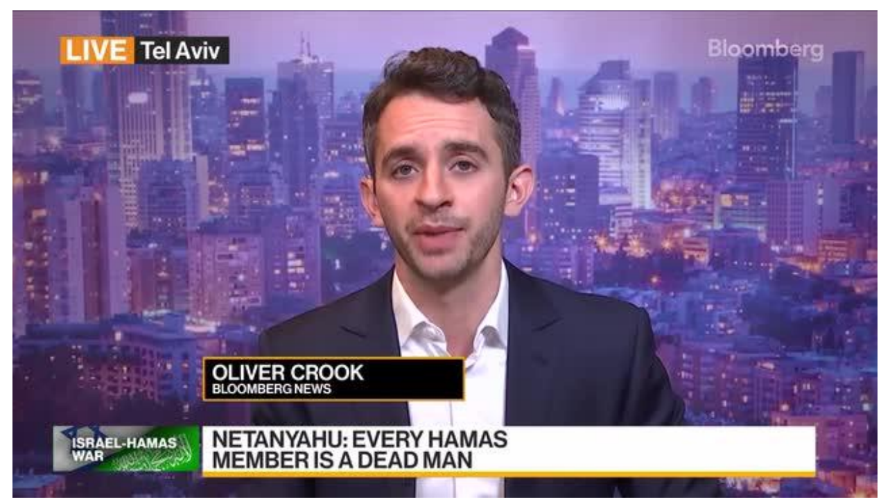
Hamas Leaders Targeted as Ground War Looms