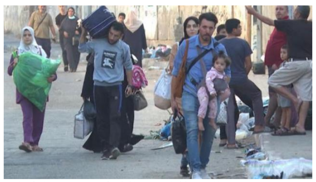
'Nowhere for them to go': See report from inside Gaza as Palestinians are told to evacuate General news \mid